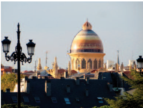
The Church of St Teresa & St John in Madrid

then leave Portugal and cross the border into Spain, where we spend the night in the lively and historic centre of the city of Salamanca.