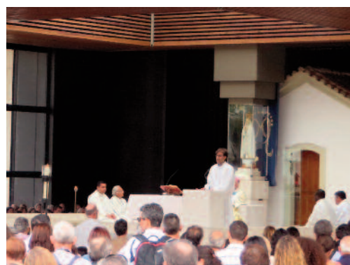
Rosary at the Apparition Chapel in Fátima