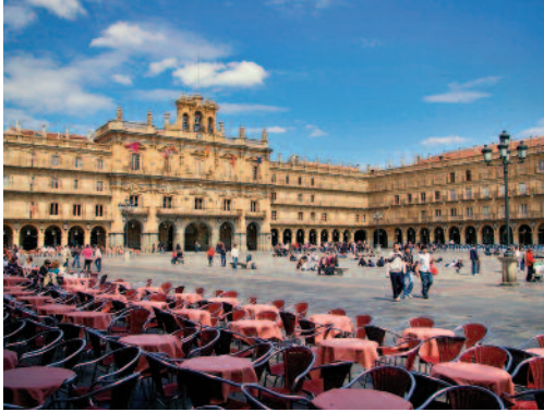
The main square of Salamanca