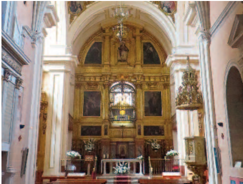
The tomb of St Teresa in Alba de Tormes