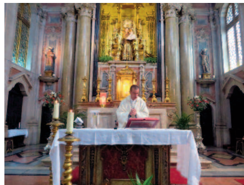
Lisbon's St Anthony of Padua church

After breakfast in our hotel we leave Fátima and drive to the picturesque city of Coimbra , the site of one of Europe's oldest universities, a UNESCO World Heritage site. Here our local expert guide will show us places such as the Old Cathedral, from 1290, and the New Cathedral, built in 1580 as a Jesuit church, and other historical sites. We