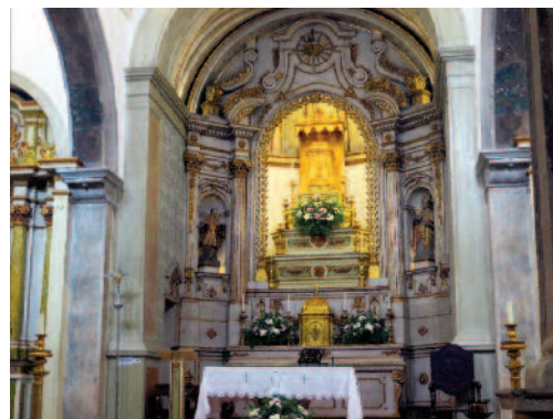
Altar of Santarém's church of the Eucharistic Miracle