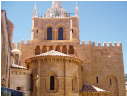
The Old Cathedral of Coimbra from 1290