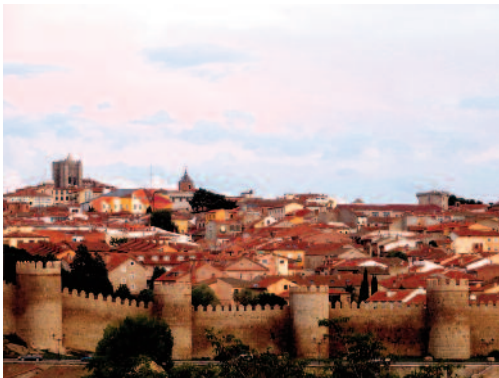
The city of Ávila